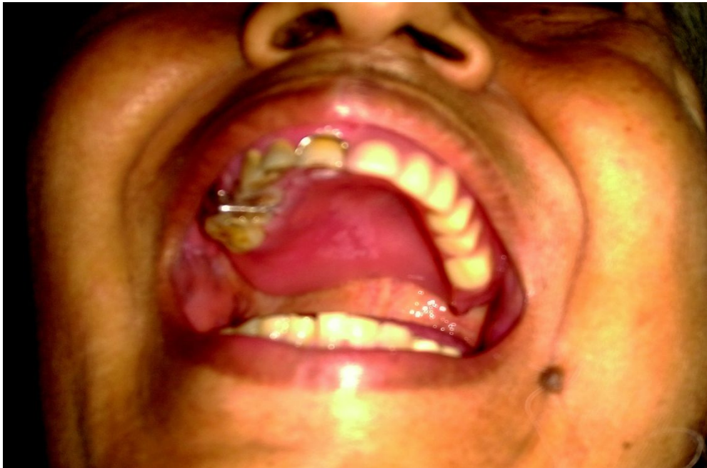
Fig 7. Definitive obturator in patient's mouth