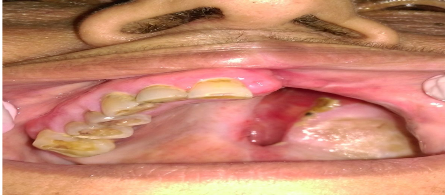
Fig 1. Well healed maxillary defect

Since the patient needed the obturator in a very short period of time, rebasing of the existing obturator was the choice of treatment.