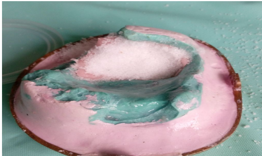
Fig 6. Salt in the defect area to create hollow bulb