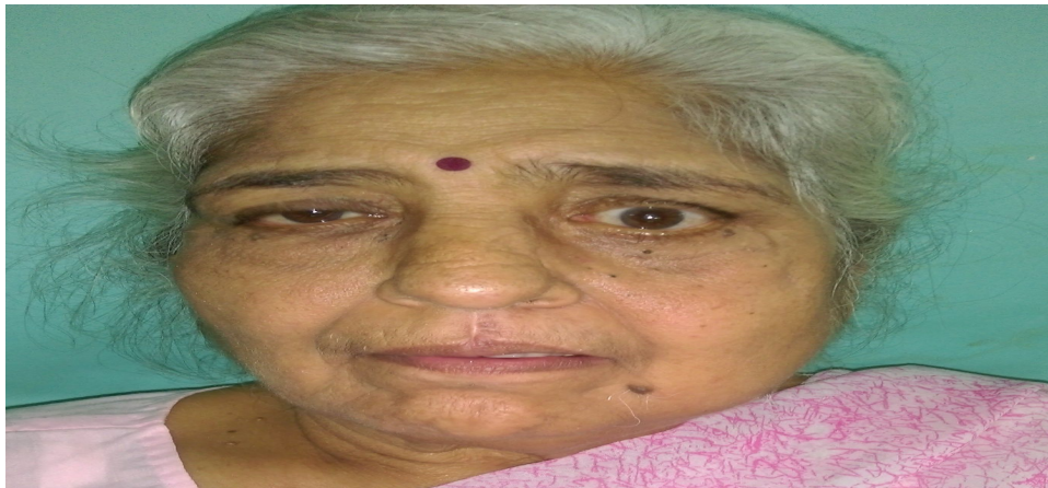
Extraoral view of patient wearing obturator