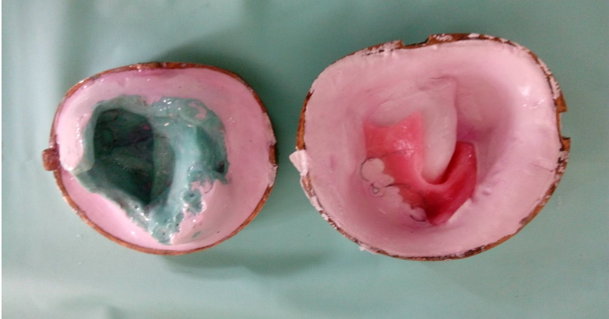
Fig 5. Dewaxing of the wax pattern