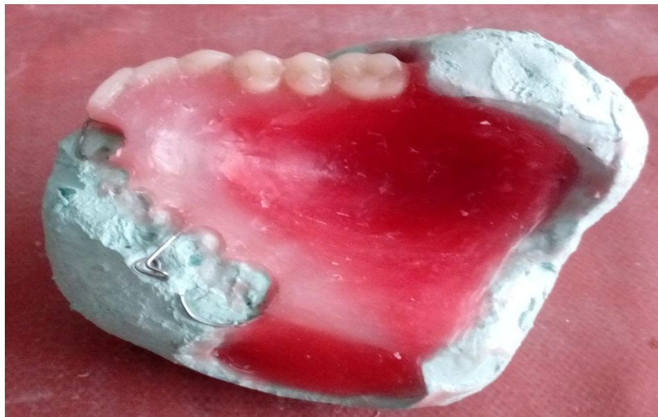
Fig. 4. Wax pattern of the defect area