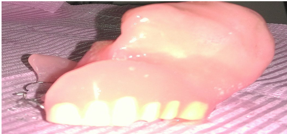
Fig 2. Existing obturator